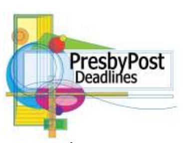
May PresbyPost Wednesday, April 17, 2024