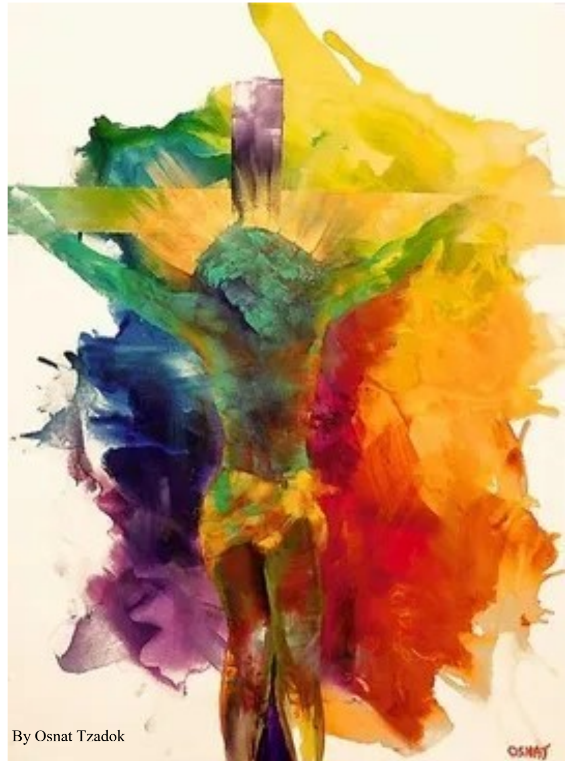
By Osnat Tzadok